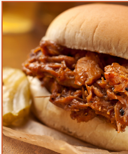
PULLED PORK SANDWICHES • $ 42 PP (vegetarian option included)

SEASONAL GREENS SALAD CLASSIC CAESAR SALAD COLESLAW POTATO SALAD PASTA SALAD