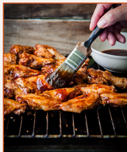
BBQ CHICKEN THIGHS & SOCKEYE SALMON • $56 PP