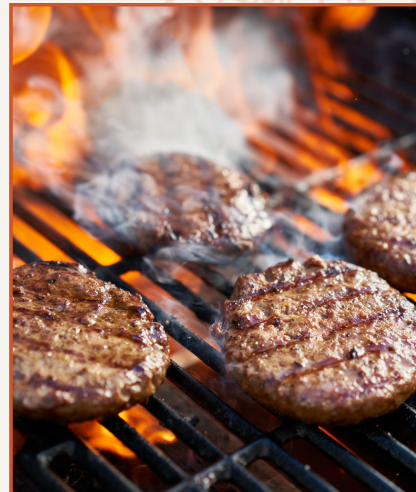
BURGER BAR • $ 45 PP (beef and vegetarian burgers)