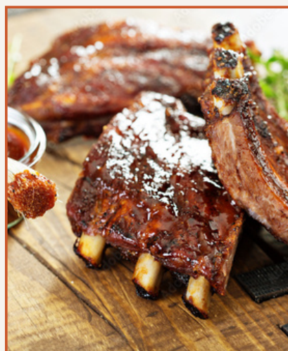
PORK RIBS • $52 PP